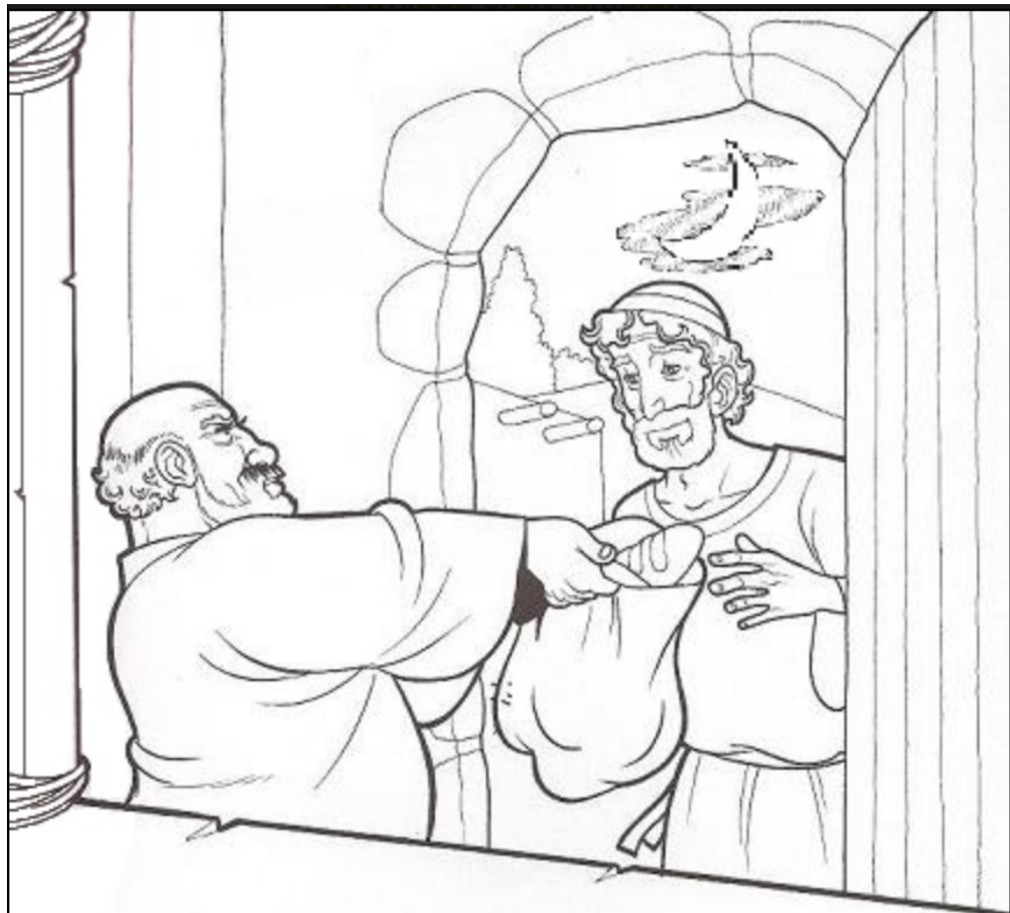
Parable of the Insistent Friend Luke 11:5-8